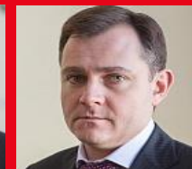
YURI SLYUSAR President of United Aircraft Corporation