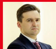
STANISLAV VOSKRESENSKY Deputy Minister of Economic Development of the Russian Federation