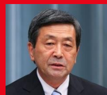
MOTOO HAYASHI Minister of Economy, Trade and Industry of Japan