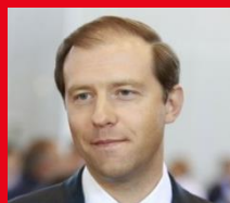
DENIS MANTUROV Minister of Industry & Trade of the Russian Federation