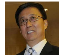
HAN ZHENG Communist Party Secretary of Shanghai