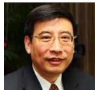
MIAO WEI Minister of Industry and Information Technology of the People's Republic of China