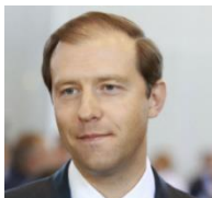
DENIS MANTUROV Minister of Industry and Trade of the Russian Federation